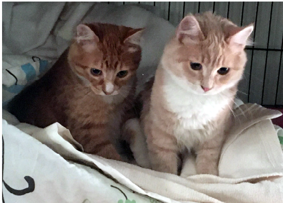
Two kittens await their new forever-homes.

Donations of cat food and dog food (and bottles for recycling) can be taken to the collection bins at Wiskers & Waggs pet store in