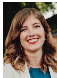
Laurel Collins, MP (Victoria)