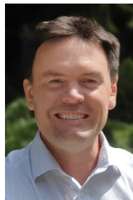
Alistair MacGregor, MP (Cowichan-Malahat-Langford)