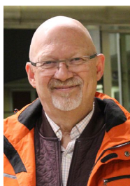
Randall Garrison, MP (Esquimalt-Saanich-Sooke)

In Cowichan-Malahat-Langford , Alistair MacGregor (re-elected for a second term) held the critic roles of Justice/Human Rights in 2016-2018 and Agriculture/Agri-Food in 2018-2019. Going forward: "I am eager to take on my role on behalf of our riding, and look forward to continuing to work together in the weeks, months, and years ahead." WSV