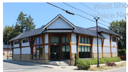
Future Forbes medical clinic sits vacant for now [File photo: Aug 2019]

● Many Sooke residents who are 'not attached' to a family physician have been eagerly awaiting the opening of a new Forbes Pharmacy clinic in Sooke at 6691 Logan Lane (behind Village Food Markets), at the corner of Murray Road. It would be the second clinic in Sooke. The other longstanding clinic is the West Coast Family Medical Center in Evergreen Shopping Centre.