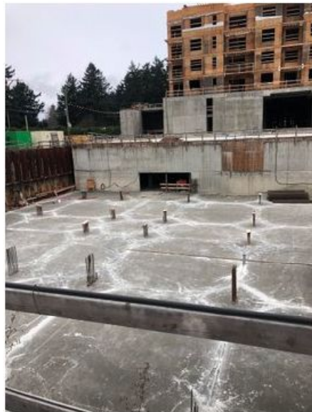
Construction at the Colwood Corners residential/commercial development this week.

● The BC Liberals slogan in recent fundraising is "Opportunity for all of BC", which is a slightly different slant than the NDP's more for-the-people approach to improve things for all British Columbians (who are likely to say "for all British Columbian"). A recent BC Liberals donation pitch says their number of donors is higher than in 2018 (without revealing a dollar total), and that funding helps the BC Liberal team "keep fighting for a strong economy that creates good jobs". They remind potential donors that corporations and unions can no longer donate, so they rely on individuals. WSV