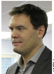
Alistair MacGregor, MP (Cowichan-Malahat-Langford)