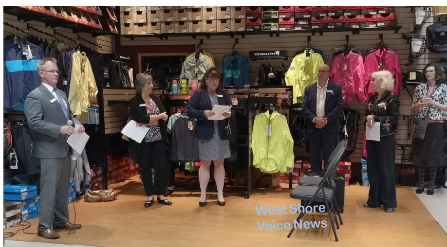
WestShore Chamber of Commerce AGM at WestShore Bicycles, November 20.

● As part of a very casual Annual General Meeting of the WestShore Chamber of Commerce on November 20 (doubling as a mixer, with catered refreshments) it was revealed that the organization has pulled itself out of the red, and had a surplus of $25,764 (called Excess of Revenues over Expenses in the non-profit world) at the end of 2018 according to the auditor's statement, though the update at September 30, 2019 showed about $37,000. At 2018 year-end, apparently $10,000 was left in the bank as 'cash' and the other $10,000 held as reserve.