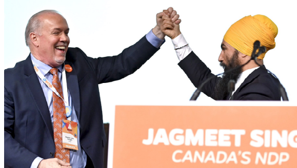
BC Premier John Horgan & NDP Leader Jagmeet Singh during the BC NDP 2019 Convention in Victoria.