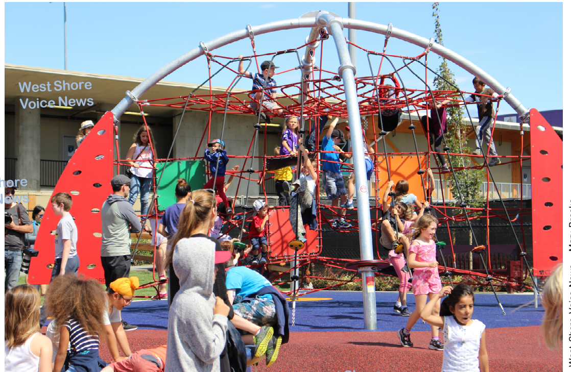
After presentations by RCMP, Premier and Mayor, kids swarmed onto the playground equipment as soon as the gates opened at the Sarah Beckett Memorial Playground.