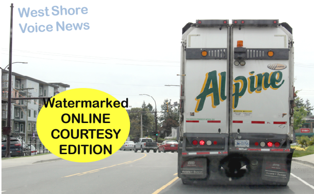
Alpine trucks are seen all around Greater Victoria (this photo, on Leigh Rd approaching Goldstream, May 2019).