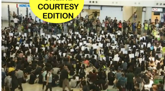
Pro-democracy activities have included sit-ins at the international airport in Beijing.

● The 2019 Hong Kong anti-extradition bill protests that started March 31 have continued for 10 weeks now, on weekends.