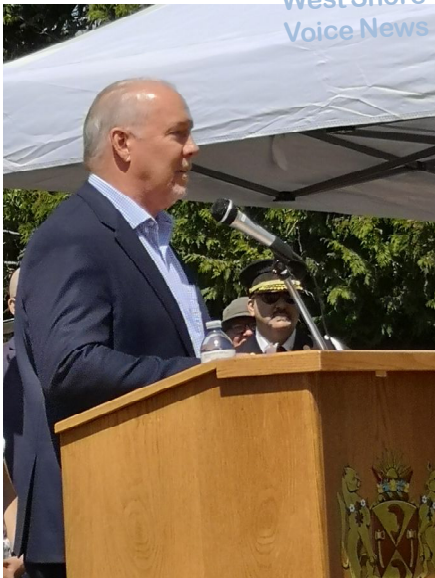
Premier John Horgan (MLA for Langford-Juan de Fuca) addressed the gathering of folks at the tree-planting event, August 6.