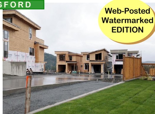
Townhomes under construction in the Nova Lands area of Westhills, on Meridian Avenue near West Shore Parkway in Langford (May 2019).

Loft: The smaller Loft Townhome floorplan of about 1,350 sq ft puts the emphasis on two extra bedrooms being on the second level when actually the main living area (including master bedroom) is on main. This is targeted at an older demographic of downsizers and anyone who seeks one-level living but with