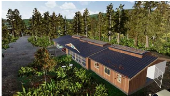
Artist's rendering of the new salmon hatchery now under construction alongside the Sooke River.

The organizers of a new salmon hatchery have been involved in discussion for six months with the staff at the District of Sooke regarding the location of the hatchery being in a flood plain.