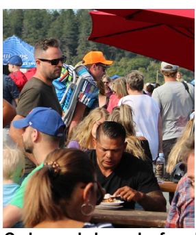
Colwood beach food

A casual beachy vibe with food and music at the ocean in Colwood is a big summer hit. Starting May 31, every Friday and Saturday will see Beach Food Fridays & Saturdays midway along the lagoon on Ocean Bouievard. From 12 noon to 7 pm. Do it at least once and you're probably hooked. WSV