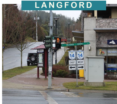
Buses will soon be able to pull over at this intersection to let cars by along Sooke Road in Langford.

● Work will start the week of March 11 to create an eastbound bus-queue jump lane at Jacklin Road and Highway 14/Sooke Road. Highway 14 runs from Veterans Memorial Parkway in Langford up to Sooke and further west out to Port Renfrew. Daily Sooke commuters are likely to benefit most, as well as in-town Langford drivers and transit users.