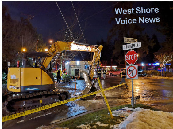
Flooding on Strathmore Rd and Goldstream Ave on February 19 due to a burst watermain.

● On the night of February 19 a CRD underground watermain burst underground on Strathmore Road right near the corner of Goldstream Avenue. It was 8 pm and cold. Water shot up high then flooded down Strathmore for about an hour. About 12 homes (including basement suites), a condo/commercial building and underground parking lot experienced flooding.