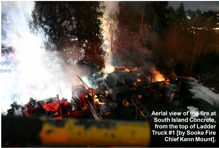
Aerial view of the fire at South Island Concrete, from the top of Ladder Truck #1.

The South Island Concrete facility on Edward Milne Road was on fire. There were a few explosions from fuel in hydraulic equipment; all flammable materials were in fact burning at one point, explained Chief Mount. Sooke Fire Rescue had their ladder truck and