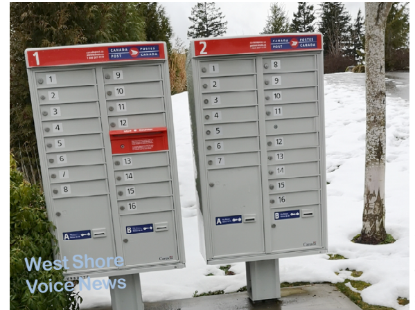
Community mailboxes in Langford as the snow begins to melt.

A Canada Post media rep told West Shore Voice News that municipalities around the region worked hard at clearing the snow as fast as they could, but lack of access to pathways up to homes and community mailboxes was sometimes a challenge. Clearing away snow and putting salt onto ice "takes a few minutes but can