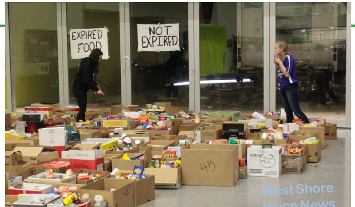
Food drive at Royal Bay Secondary (WSV file photo: Dec 2017).

10,000 Tonight food drive Wed Dec 5 at Royal Bay Secondary School. 5 to 10 pm. Donations to the Goldstream Food Bank. Belmont Food Drive in partnership with CBC food bank day. Fri Dec 7 , 7am-7pm. Drop off non-perishable food items & gently used clothing to Langford Legion, 761 Station Ave. 10,000 Tonight food drive by EMCS in Sooke. Wed Dec 12 , 5 to 9 pm. Donations will be given to the Sooke Food Bank. WSV