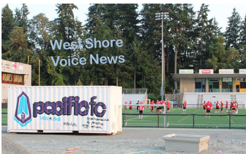
This week, Pacific FC was already getting settled in for soccer practice at Westhills Stadium in Langford (July 30). WSV

Weekend news digest (print & online) published by Brookline Publishing House Inc