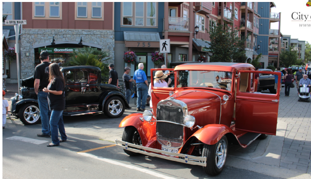
West Shore Voice News

Sunday, August 19, Langford Show and Shine car show. 10 am to 3 pm. Road Closures: Goldstream Ave, from Peatt Rd to Veterans Memorial Pkwy, portions of both Bryn Maur Rd and Claude Rd will be closed to all through traffic from 7 am to 4 pm. Peatt Rd will be congested and it is recommended to use an alternate route. Event Preparation: Overnight and early morning street parking for the roads affected by Show n' Shine will be unavailable on the night before the event.