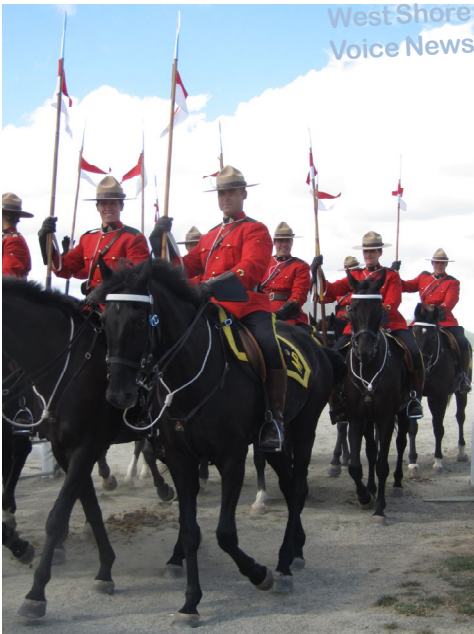
West Shore Voice News

Daily digital news at www.westshorevoicenews.com