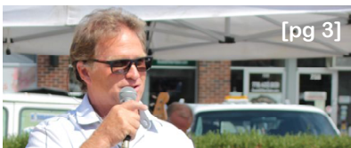
8th Annual Langford Show & Shine coming up August 19: bigger & better each year.

What makes this west side of Vancouver Island tick? News & views on business & economy, health & wellness, education, the arts, politics, sustainability, the young Z-generation, & social trends.