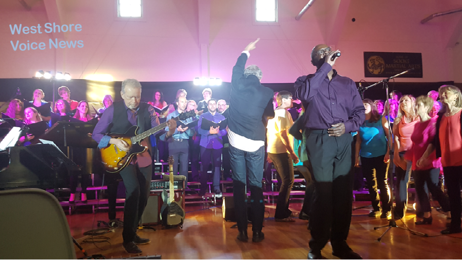
It was a rockin' good time at the Sooke Community Choir 'HITS' concert, May 4.