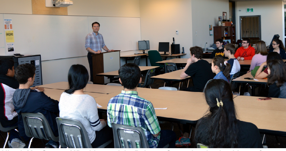
Alistair MacGregor, MP addressed the Belmont Secondary leadership conference.

● Alistair MacGregor, MP (Cowichan-Malahat-Langford) addressed the Belmont Leadership Conference at Belmont Secondary School in Langford on Saturday, May 5. He spoke passionately about his journey into public service, his roles both in Ottawa and his constituency, and what it personally means for him to be a community leader. "I am always happy for a chance to connect and engage with our youth," stated MacGregor.