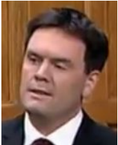
Alistair MacGregor, MP (Cowichan-Malahat-Langford)

Alistair MacGregor, MP supports local efforts to have the Cowichan Weir raised as “green infrastructure” on the Cowichan River. In the House of Commons this week he asked that the Dept of Oceans & Fisheries commit to funds for the project, to overcome critically low river flow rates due to climate change. Slow-moving water with higher temperatures poses a risk to fish and fish habitat. Holding back more lake water will ensure an adequate supply of water flow in summer months. WSV