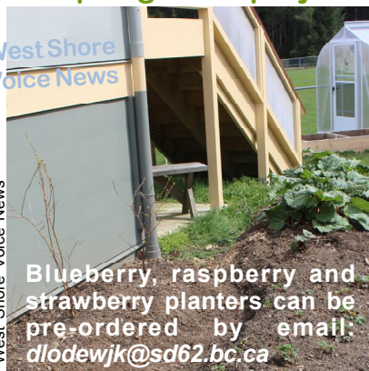
A garden getting started at SD62's Colwood Campus (April 2017 file photo).