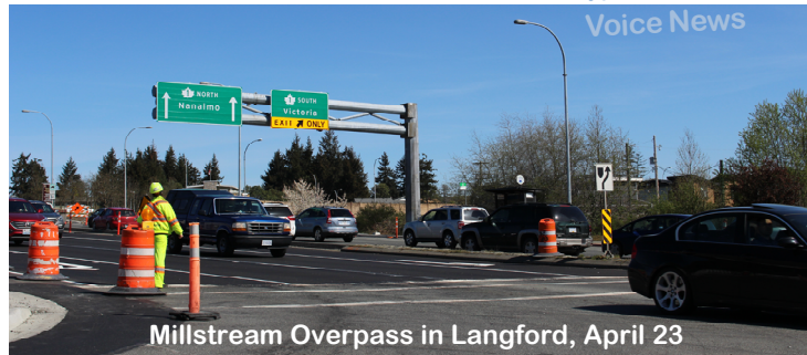
Millstream Overpass in Langford, April 23

● Traffic Update LANGFORD: As part of the construction of the Millstream Dual Left Turn Lane Project, the second left turn lane is now active. As of April 27, City of Langford Engineering said: "Drivers are encouraged to use both left turn lanes now open on the Millstream overpass." In addition, a second left turn option now exists on Peatt Road turning left (north) onto the Millstream overpass where -- until now -- the traffic backups could be lengthy. WSV