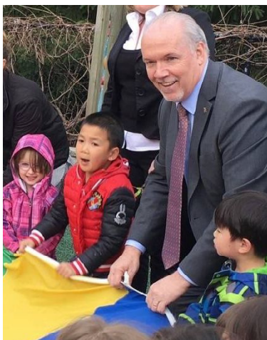
BC Premier John Horgan at the March 28 announcement of child care cost savings for parents.

The government says that new affordable child care benefit will help reduce child care costs for lower-income families by up to $1,250 per month and will support 86,000 BC families each year by 2020-21. WSV