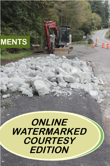
Jack-hammered concrete: removing a freshly installed bus pad on Sooke Road (April 9).

The pullouts are for the purpose of allowing buses to move fully out of the way of traffic. It's one measure that the BC Government feels will help reduce interruptions in vehicle traffic flow on Highway 14, as first announced by Premier John Horgan in Sooke on January 19. Horgan is MLA for Langford-Juan de Fuca.