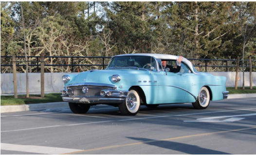
Langford Mayor Stew Young opened the Bear Mountain Parkway April 10, 2018

Opening up the economic region of Langford and the west side of Vancouver Island.