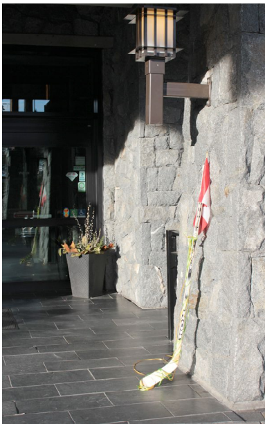
A hockey stick adorned with ribbon in the green-and-yellow colours of the Humboldt Broncos rests near the entry to the sports-friendly Bear Mountain Resort in Langford.

Weather conditions were bright and clear on the day of the accident. But the corner at Hwy 35 and Hwy 335 in northern Saskatchewan has been considered by locals for years to be dangerous due to minimal crossing management (a stop sign for one highway but through-traffic for the other) and a tall stand of old-growth trees that might be found to have blocked the sightlines for traffic coming from one or both directions. WSV