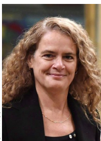
Governor General Julie Payette