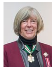
Lt Governor Judith Guichon