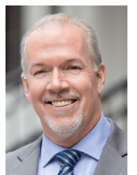
BC Premier John Horgan

including the Premier, as well as with community members from around the province, and with members of the Royal Canadian Navy.