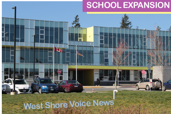
Royal Bay Secondary: getting 600 more seats by Sept 2020 to keep up with population demand.

● Royal Bay Secondary school in Colwood with a student population of 1,085 is beyond the building's original capacity of 800 students. Bursting at the seams presently at 135% capacity, the pressure is on as the west shore continues to rapidly attract families to the relative affordability of housing in the region.