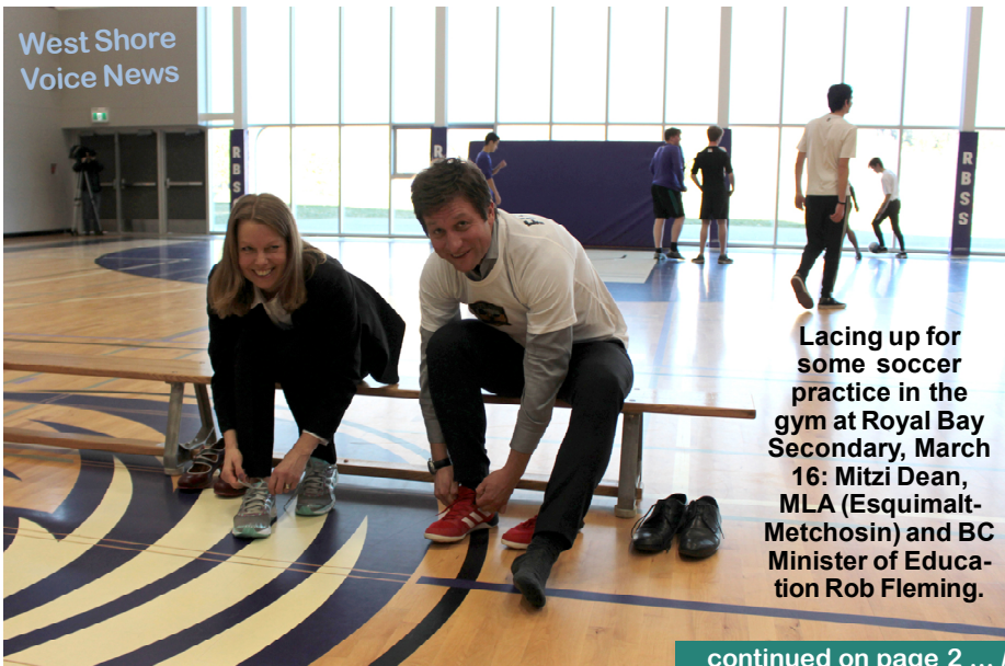
Lacing up for some soccer practice in the gym at Royal Bay Secondary, March 16: Mitzi Dean, MLA (Esquimalt-Metchosin) and BC Minister of Education Rob Fleming.

Introductions were made at the morning announcement by Mitzi Dean, MLA (Esquimalt-Metchosin) in whose riding Royal Bay Secondary is essentially a hub