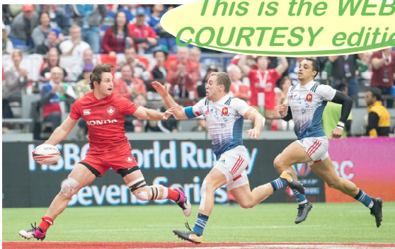
The HSBC Canada Men's Sevens Vancouver Tournament attracted over 77,000 fans to BC Place, March 10-11.