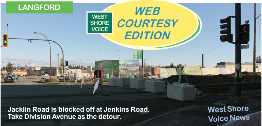
Roadwork & improvements on Jacklin Road at Jenkins Avenue began February 13 on schedule, alongside the upcoming Belmont Residence and Belmont Market.

● Belmont Residences , a new 24-acre, 440-unit multi-phase development at Jenkins Avenue and Division Avenue in Langford, will officially break ground on Thursday, March 1. Members of the Ledcor Property Development team will be joined by representatives from the City of Langford for the ground-breaking ceremony.