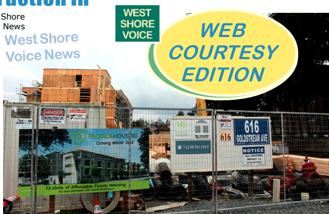
Construction underway at 616 Goldstream Ave in Langford.

The Oak Park redevelopment project received a provincial injection of $7.5 million toward the two-phase construction of 61 apartments and 12