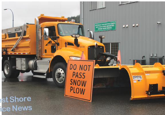
Mainroad South Island has equipment and signage ready for Sunday's expected snowfall.

Drivers are reminded to slow down, drive carefully, and use extra caution with driving near roadside