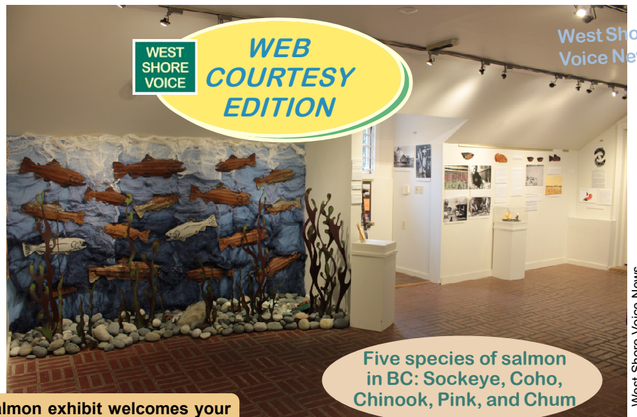
Five species of salmon in BC: Sockeye, Coho, Chinook, Pink, and Chum