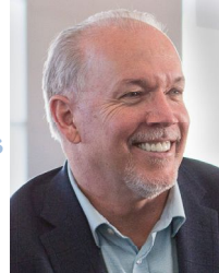
BC Premier John Horgan