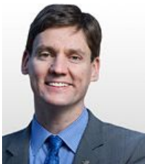
BC Attorney General David Eby

The changes come in the wake of multiple