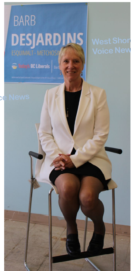
West Shore Voice News