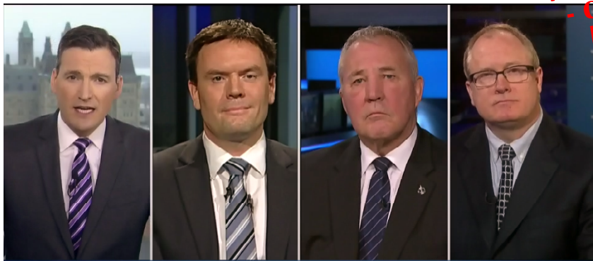
Live broadcast screenshot