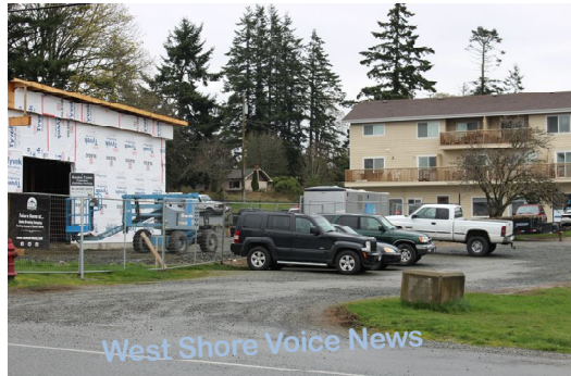
Unpaved lot on Otter Point Road across from Eustace Road, in Sooke town center.

To deal with parking concerns of local merchants who find people leaving their vehicles long-term in retail parking areas, the District of Sooke decided last year to pay $24,000 per year (about $2.65 per property taxpayer) to the Phillips-family property owners for use of an unpaved lot in Sooke town centre off Otter Point Road (where Sooke Country Market is held in summer). A small sign identifies the spot as "Sooke Town Centre Overflow Parking". But did you know about it? Do you use it? Apparently it's also to ease up traffic congestion during large town-central events that happen once a year, like Sooke Fall Fair in September or the outdoor Sooke Philharmonic concert in July. But most of the time it sits relatively empty. You could be using it to park and then take the bus.