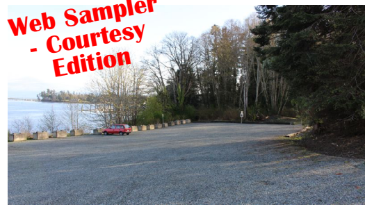
Unpaved lot at the foot of Maple Avenue South, leading to a trail that further leads to the roadside at the front of the Prestige hotel. Then it's a further walk through the Prestige parking area to reach the docks.

Then, to deal with that problem-waiting-to-happen due to a shortage of District-owned parking spaces near the Sooke Public Boat Launch (at the foot of the Prestige Oceanfront Resort), last year the District of Sooke decided to pay $18,000 per year (about $2 per property taxpayer) to the Butler-family property owners. That's for use of prime waterfront property as an unpaved lot off of Maple Avenue South (near the Government docks) as Public Boat Launch overflow parking. So far, there's no fee to use the parking area. After you park there, it's a bit of a hike on a new trail to get to the waterfront at the foot of the Prestige. The trail is in nice shape now, but will require maintenance (line item already in the Sooke Five-Year Financial Plan).