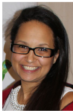
West Shore Voice News