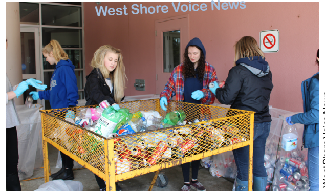
Cheerleaders sort bottles one day during spring break out front of EMCS. It's grungy work, but pays big time for their trip to the high school cheerleader competitions.