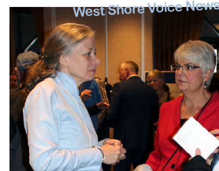
West Shore Voice News

Public concerns included odour control, noise mitigation, pipe and pump safety (especially in the event of an earthquake), and access by fire vehicles and ambulances to any homes in the construction area as required. WSV