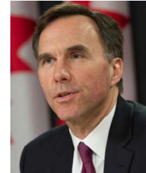
Finance Minister Bill Morneau

"Through smart, responsible investments and a focus on trade and openness, the Government of Canada believes that all governments can seize the opportunity to create good, well-paying jobs and prosperity for citizens and their families," said federal