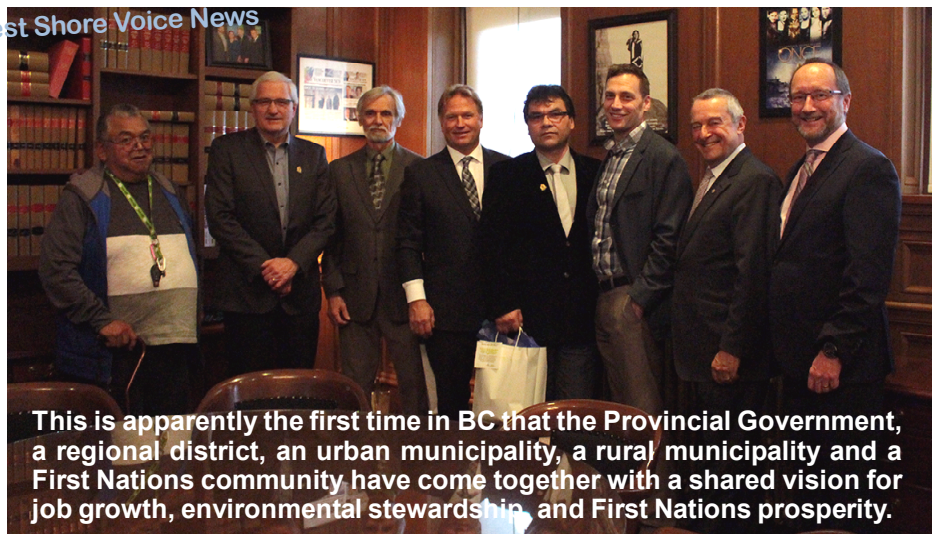
This is apparently the first time in BC that the Provincial Government, a regional district, an urban municipality, a rural municipality and a First Nations community have come together with a shared vision for job growth, environmental stewardship, and First Nations prosperity.