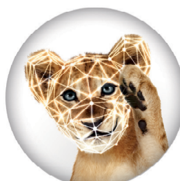
facial recognition technology

Featuring a face scanning entryway and calorie-counting countertop powered by TELUS PureFibre™