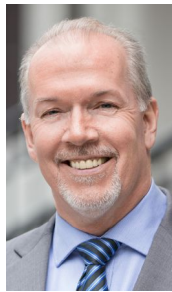
BC NDP Leader John Horgan, MLA (Incumbent)