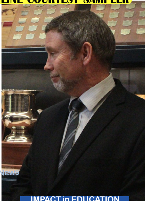
West Shore Voice News