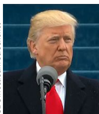
US President Donald J Trump during his inaugural speech, January 20, 2017