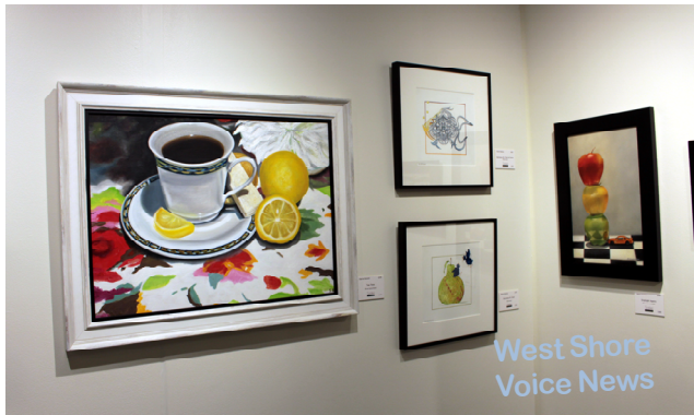
Paintings are in some cases clustered by content themes.