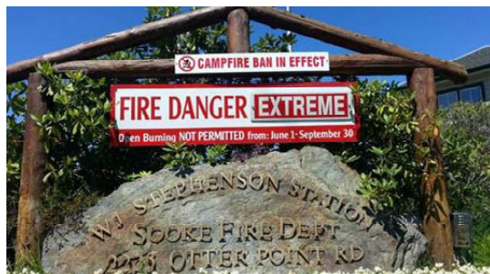
EXTREME is the highest Fire Danger Rating. Campfire ban is in effect.

Hot dry weather is expected to continue well into August. The Weather Network forecast for Sooke (as of July 28) shows little to no precipitation expected between July 29 and August 10 (which includes the BC Day long weekend, August 5 to 7). Temperatures in that time frame