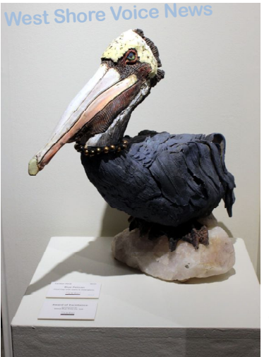
West Shore Voice News