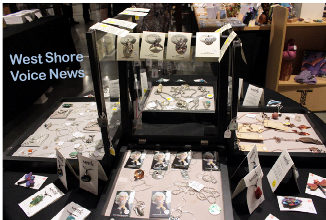
Original artistic creations fill the retail gift shop set up for the 11 days of the Sooke Fine Arts Show.