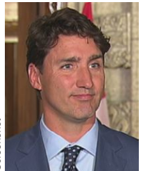
Prime Minister Justin Trudeau

Premier John Horgan wasted no time getting down to the business of running the government of British Columbia last week.