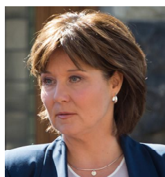
Christy Clark outside Government House on June 29, in the final days of her tenure as Premier of BC.

inexplicable ethereal energy that seeps into almost everyone who pauses here awhile -- speaks loud to the region. The message is this: art is awesome for both people and the economy, and here's a place where special art is created by and for us, for you. ■