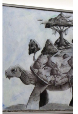
Youth Art Exhibit

Schedules and list of this year's 80 sponsors: www.sookefinearts.com WSV