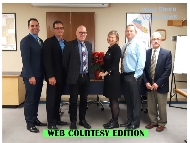
WEB COURTESY EDITION