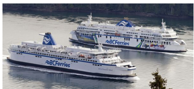
Large vessels: Spirit of Vancouver Island and Coastal Renaissance passing each other in Active Pass.

● In January 2018, the BC government will begin a comprehensive review of the coastal ferry service to evaluate performance in meeting the needs of ferry users and BC's coastal communities. Improvements to the existing model will be identified, including the Coastal Ferry Services Contract "to better serve the needs of ferry users and coastal communities".