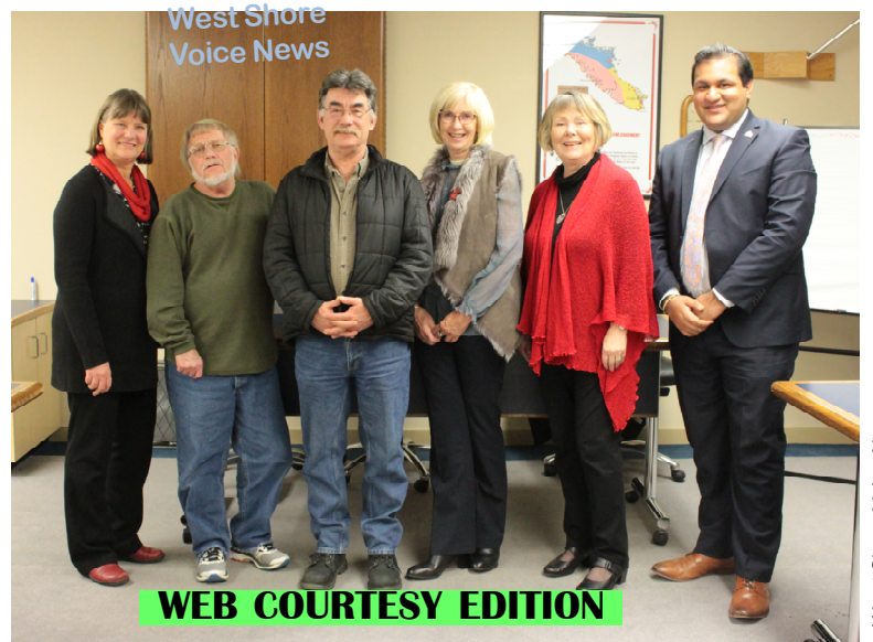
WEB COURTESY EDITION