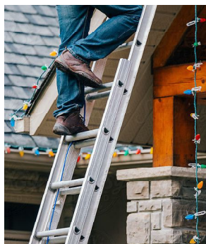
Ladder safety at Xmas time.