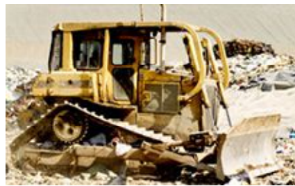
Working the materials at Hartland Landfill. About 114,000 tonnes of municipal solid waste are received at the facility each year. The Capital Regional District projects the current landfill setup being full by 2049.

● It's a busy and distracting time of year to think about new political structures. But the Capital Regional District (CRD) is seeking members from the Greater Victoria community to serve on a new Solid Waste Advisory Committee. The committee will operate 'twice removed', i.e. report to the CRD's Environmental Services Committee, which in turn would report to the full CRD board.