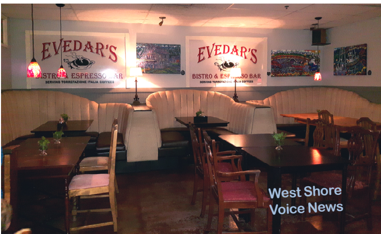
Cozy dining area within the meandering floorplan at Evedar's Bistro.

Evedar's Bistro in central Langford offers seating styles for coffee, dining and lounge. Under the creative eye of new manager Laurie Tomin, the 78-seat eatery is proud of a