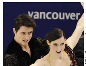
Canadian skaters Tessa Virtue and Scott Moir in Vancouver in 2010 (during Compulsory Ice Dance at the Pacific Coliseum).

The event is an Olympic-qualifier for Canada's team at the 2018 Olympic Winter Games in South Korea. The championships will feature about 250 skaters, competing in the men, women, and pair ice dance disciplines. About 8,000 spectators are expected to attend, with thousands more throughout Canada watching via CTV's live broadcast. The anticipated economic activity generated by the competition is approximately $6 million, said a Ministry of Tourism, Arts and Culture news release on December 8. WSV