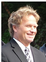
Langford Mayor Stew Young

● We're going to make Langford even better in 2017, " says Langford Mayor Stew Young.