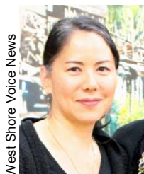
Sooke Mayor Maja Tait

● As 3rd vice-president of the Union of BC Municipalities (UBCM), Sooke