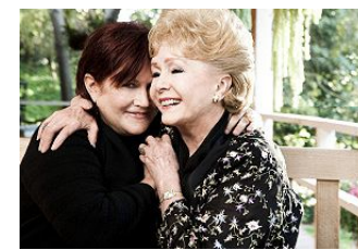
Actor Carrie Fisher (left) with her Hollywood star mother Debbie Reynolds: complexities of celebrity life.

Fisher was quoted in earlier years saying she was "the product of Hollywood in-breeding" and that she suffered in the tremendous shadow of her mother's celebrity and starlet good looks.