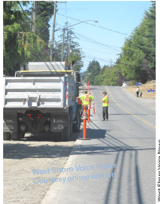
West Shore Voice News

It's one of those evident infrastructure improvements that results from budgeting, planning and the political will to get things done. WSV