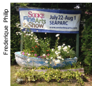
West Shore Voice News is pleased to be a sponsor of the Sooke Fine Art Show