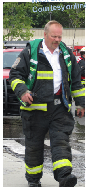
West Shore Voice News

The District of Sooke will fill an interim 3-month position while they go through a hiring process (open to both internal and external candidates). WSV