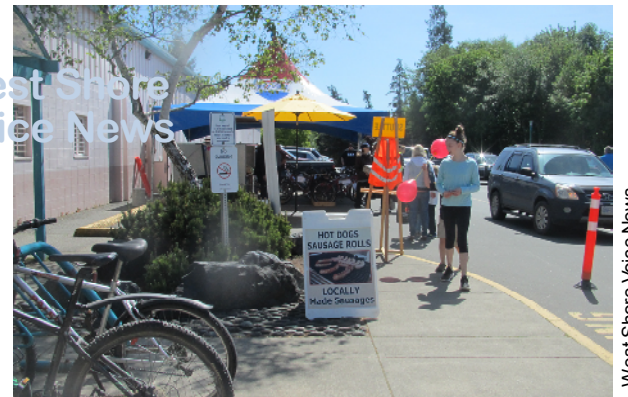
Refreshments for sale outdoors, and also indoors.