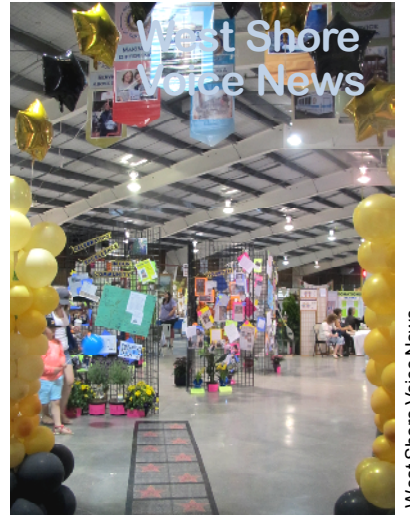
'Excellence in Sooke' displays were part of the entry experience.