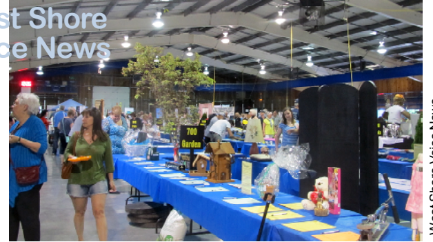
Rows and rows of silent auction items for people to view.