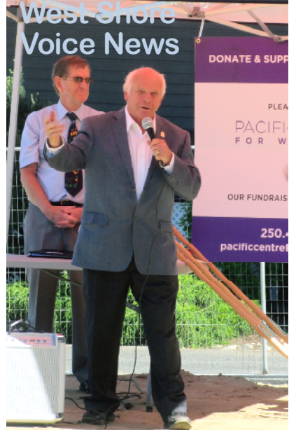
West Shore Voice News