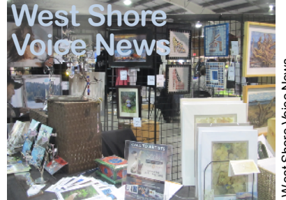
Colourful eye-popping display by the Sooke Community Arts Council.