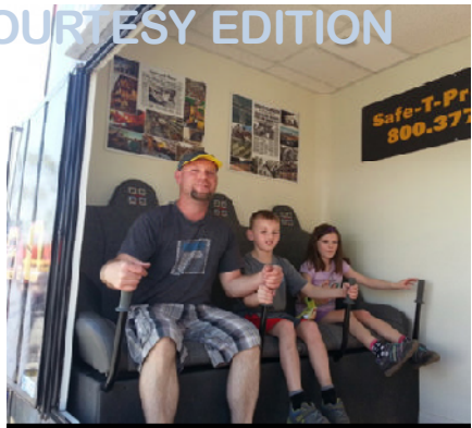
Get a good shaking at 8.0 Magnitude in the Quake Cottage: May 22 in Sooke.

A film called The Convenient Groom was in production this week in Sooke at the Prestige Oceanfront Resort, making a bit of a local splash with actors Vanessa Marcil (General Hospital, Beverly Hills 90210) and David Sutcliffe (Gilmore Girls). WSV