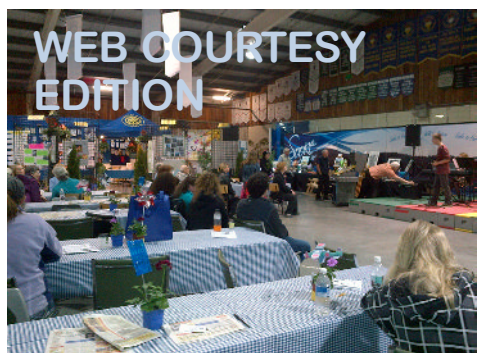
The Sooke Rotary fair offers a relaxing area for refreshments, entertainment stage, and displays (this photo from 2014).