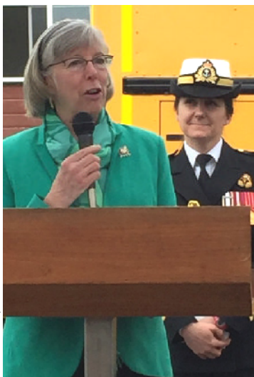
BC Lt Gov Hon Judith Guichon addressed the Expo on April 5.