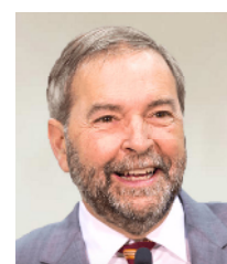
Tom Mulcair NDP Leader