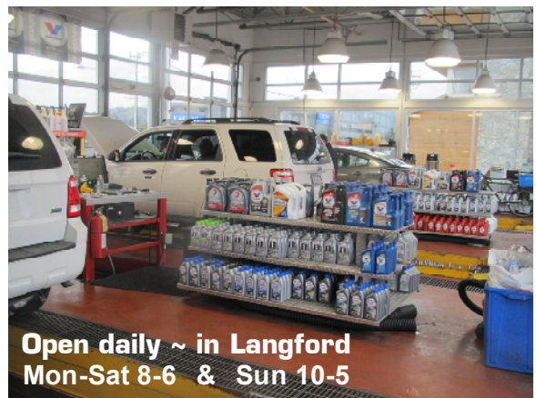
Open daily ~ in Langford Mon-Sat 8-6 & Sun 10-5

In addition to oil changes, filters can be changed and other maintenance done. A wide range of products are readily on hand.