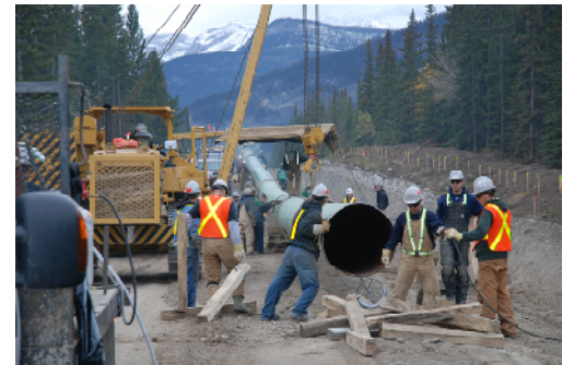
Trans Mountain's Anchor Loop project was completed in 2008 through Jasper National Park and Mount Robson Provincial Park. The project involved installing a second pipeline adjacent to the existing Trans Mountain pipeline between Hinton, Alberta and Hargreaves, BC.