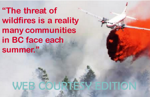
"The threat of wildfires is a reality many communities in BC face each summer."

"The threat of wildfires is a reality many communities in BC face each summer, and we need to ensure we have the right tools and assets in place to protect families and infrastructure," said Thomson. "Wildfire management will always rely on a fleet of dependable aircraft to assist the men and women on the ground who extinguish the fires."