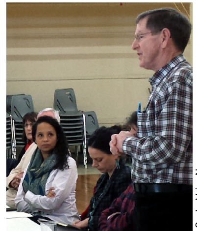
WEB COURTESY EDITION