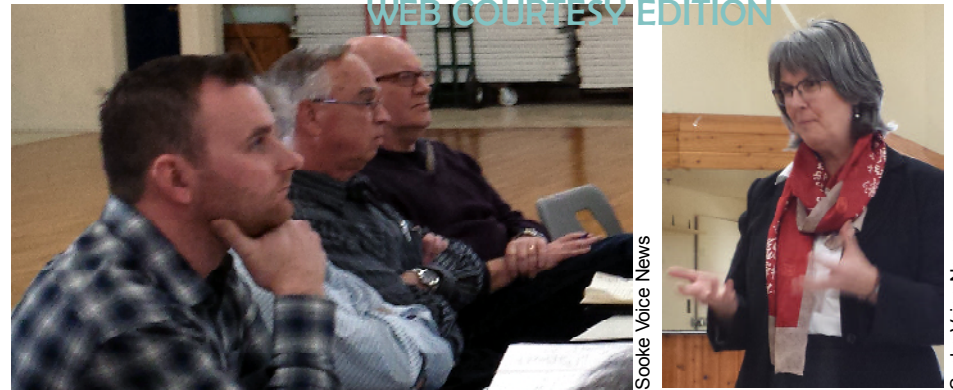
^ Above, from left: