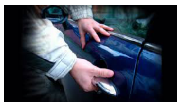
Make sure your car door is locked, to help prevent thefts.

● Thefts from vehicles in the Sooke area have increased in the past few months, says Sooke RCMP Detachment Commander Jeff McArthur.