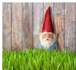
Garden ornaments are among the missing items taken when yards have been accessible.

Sooke RCMP reminds the community to not leave valuable items in vehicles. Any suspicious activity should be reported to the local detachment at 250-642-5241, says McArthur. WSV